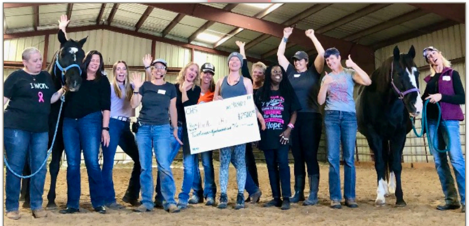
October 2021 program, was able to celebrate the fundraising efforts of the CHS Rebels Volleyball Team!